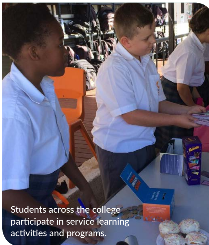
Students across the college participate in service learning activities and programs.

Our aim is to embrace our community and celebrate the diversity of our students and their families. The Carey Community provides a place for families to belong and support others. It is also a place where families can be supported and cared for as we journey together.